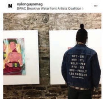
When your excellent iPhone photography skills make the #nylonmag insta! thanks to @nylonmag for coming to check @giannilee's 'Why Won't You Hear Me' exhibit. Full feature dropping soon 🍷 #primeculturecreative (at BWAC Brooklyn Waterfront Artists Coalition)