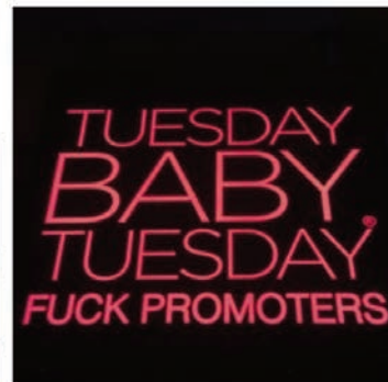
#Fuckpromoters Happy Birthday @madeintyo 📍 (at Up & Down)