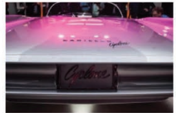
Candy Paint 🍷 full photo set snapped by @elijahd0m on @primeculturecreative 📺 (at Cadillac House)