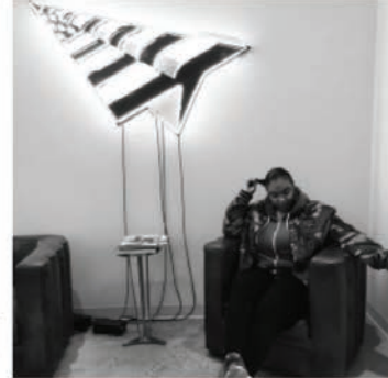
grow or get left 💙 (at Rocnation HQ)

Read my full interview on how I got my start in the entertainment industry, my thoughts on preparing for a career prior to graduating college, and the most influential factor in my life thus far here: http://www.boybait.wtf/boybait-babes/2017/5/11/the-media-maven