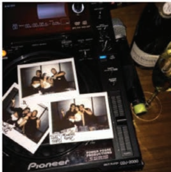
So much fun last night with @dylanthegypsy spinning the jams for @cadillac 🍷 go peep all the eye photos from last night snapped by @elijahd0m on the @primeculturecreative page 📺 (at Cadillac House)