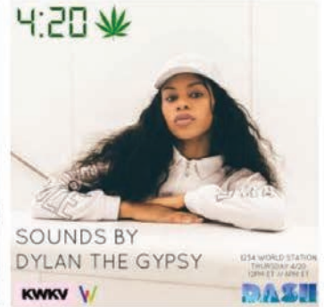
@dylanthegypsy spinning an exclusive 4.20 mix for @kwkrystalvega's segment on #DASHradio 📻 tune in tomorrow at 12PM!